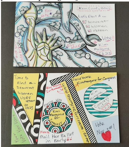
Two designs: Vote or Liberty